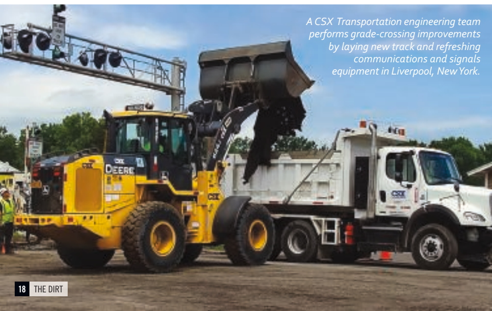
A CSX Transportation engineering team performs grade-crossing improvements by laying new track and refreshing communications and signals equipment in Liverpool, New York.

As the pandemic spreads around the globe, so do acts of kindness. Through its Pride In Service program, CSX teamed up with Operation Gratitude to deliver jumbo care packages and handwritten letters from grateful Americans to police, fire departments, and hospital workers. CSX also partnered with The Conservation Fund to provide grants to nonprofit organizations that store and distribute fresh produce, meat, and dairy products to underserved communities.